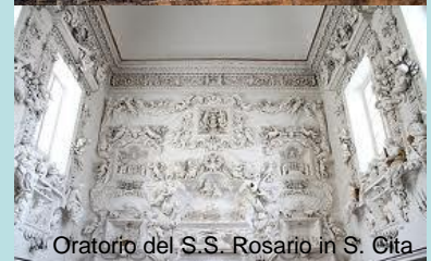
Oratorio del S.S. Rosario in S. Cita