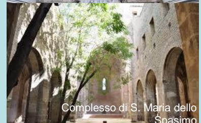
Complesso di S. Maria dello Spasimo