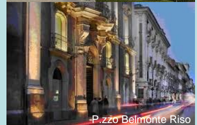
P.zza Belmonte Riso