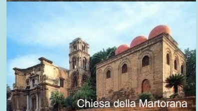
Chiesa della Martorana